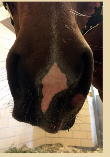
Head tilt and corneal ulceration. Facial nerve paralysis and muzzle deviation.

testing (BAER) will reveal partial or complete hearing loss. Tympanocentesis, or aspirating fluid from the eardrum, can identify potential bacteria and help determine proper antibiotic usage.