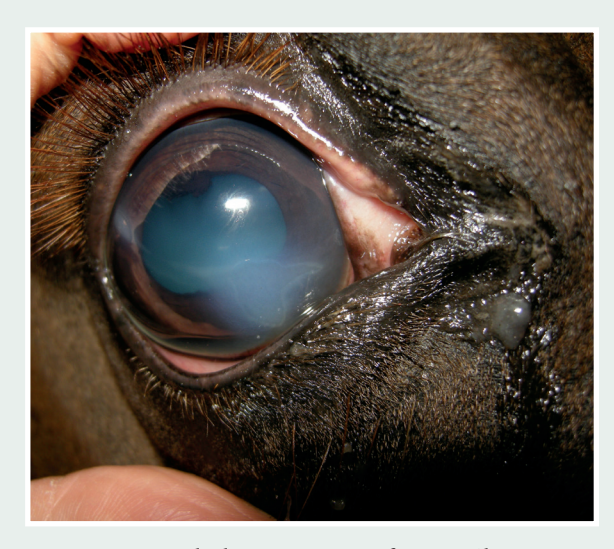
Corneal ulcer.