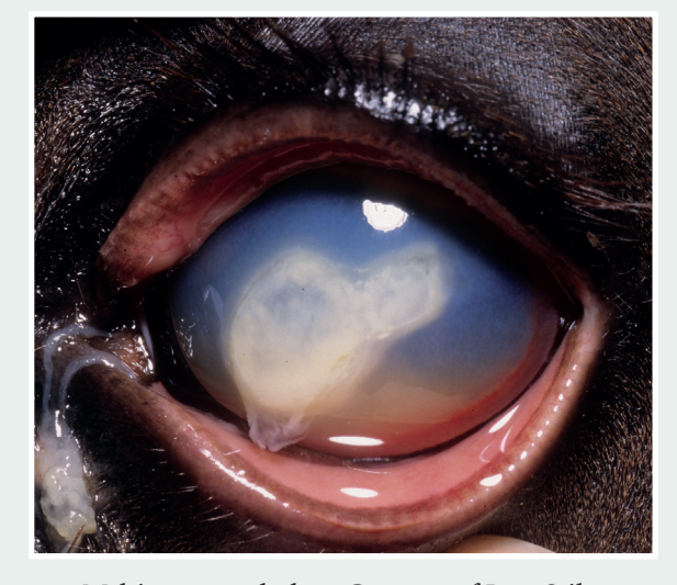
Melting corneal ulcer.