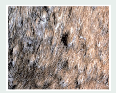
Figure 1. Paintbrush lesions seen with Dermatophilosis congolensis.

If your horse has been diagnosed with rain rot, don't fret! Keeping your horse clean and dry and preventing contact with other horses until the lesions are cleared will be essential to properly managing this disease. Topical products such as lime sulfur and chlorhexidine solution can be used to treat the lesions produced by D. congolensis . Limiting moisture and skin damage will be key to preventing your horse from ever obtaining rain rot. Caprylic acid and its derivatives may be useful treatment options for rain rot in the future.